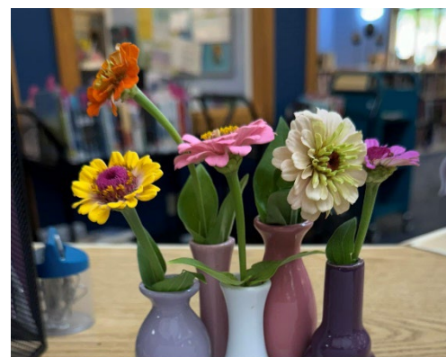
THESE FLOWERS WERE BROUGHT IN BY A PATRON WHO GREW THEM FROM THE FREE SEEDS AVAILABLE IN THE SEED LIBRARY